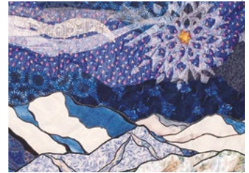
A Great Light (detail), fabric banner, 6' x 9'

14 ALICE GANT You'll find animals, heroes, birds, singers, plants and planters in my banners. Like large illustrations made of cloth, they embellish walls both public and private. Banners banish blues. Location: 39 Whig Street, Trumansburg, NY 14886; 607-387-3934; gcaffe@gmail.com