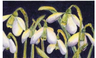
Snowdrops (detail), watercolor, 3" x 6," 2010

16 NERYS GREGORY I love to paint vibrant watercolors of flowers, trees and landscapes but I also enjoy providing clients with commissioned paintings of their homes and a wide range of other subjects. Location: 14 Hunter's Lane, Ithaca, NY 14850; 607-539-6734; nerysgregory@msn.com