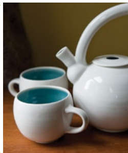
Porcelain Tea Set, 2009, $112