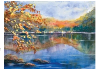
Adirondack Fall, watercolor, 16" x 12", 2009

30 NARI MISTRY Landscapes in bold colors express my vision of the many waterfalls and beautiful scenes around Ithaca. Some of my paintings are representational, most are expressive, some pure fantasy. Location: 1159 Ellis Hollow Rd, Ithaca, NY 14850; 607-272-7496; nbm2@cornell.edu; www.artbynari.com