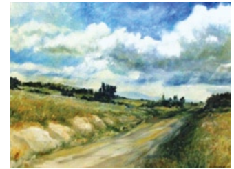
Grand Day in the Uplands, oil on linen, 18 x 24, 1993

28 HARRY MCCUE The studio on my farm is at the outer limits of the Art Trail's solar system. Estate wineries, Amish neighbors, great scenery and my artwork make it a worthwhile adventure. Location: 2423 Skinner Road, Lodi, NY 14860; 607-582-6252; hmccue@ithaca.edu; http://faculty.ithaca.edu/hmccue