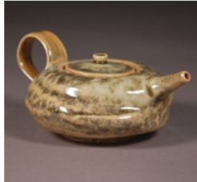
Small Carbon Trap Teapot, porcelain with carbon trap shimo glaze, 3" x 5", 2009, $65

28 HARRY MCCUE The studio on my farm is at the outer limits of the Art Trail's solar system. Estate wineries, Amish neighbors, great scenery and my artwork make it a worthwhile adventure. Location: 2423 Skinner Road, Lodi, NY 14860; 607-582-6252; hmccue@ithaca.edu; http://faculty.ithaca.edu/hmccue