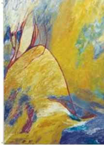
Bee-loud Glade, 84"x72", oil on canvas, 2009