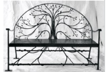
Alex Haley Bench, steel