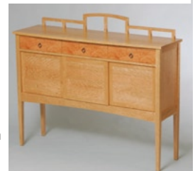
Sideboard, cherry and madrone burl, 60" x 18" x 42"

We are a husband and wife team who collaborate in the design and making of one of a kind and commissioned fine furniture and objects. We welcome client participation in the design process. Location: Wolff & Nagel, 5 Canaan Road, Brooktondale, NY 14817; 607-539-6961; wolffandnagel@frontiernet.net; www.ithacafinefurniture.com