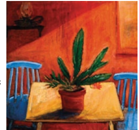
Interior with Blue Chair, oil, 22" x 23"