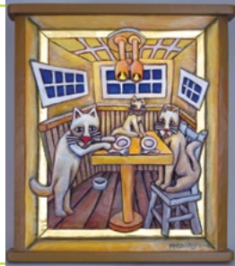
Three Hungry Cats, acrylics and gold leaf on carved pine, 20" x 17" x 1.5," 2009, $2,500