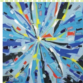
Modern Art Two, acrylic on canvas, 48" x 48"